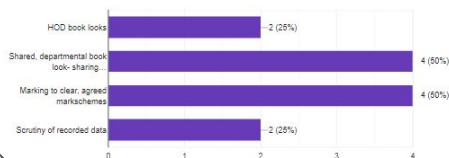
How do you ensure consistency in data across the department? 8 responses

Evaluation of feedback on departmental data strategies and use of data to provide qualitative evidence. Planning for next steps.